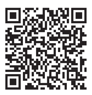
SCAN QR CODE WITH YOUR PHONE CAMERA

Please arrive on time! If you are more than 5 minutes late for your appointment, you must either reschedule your appointment or wait as a walk-in patient (this may result in a longer wait time to be seen).